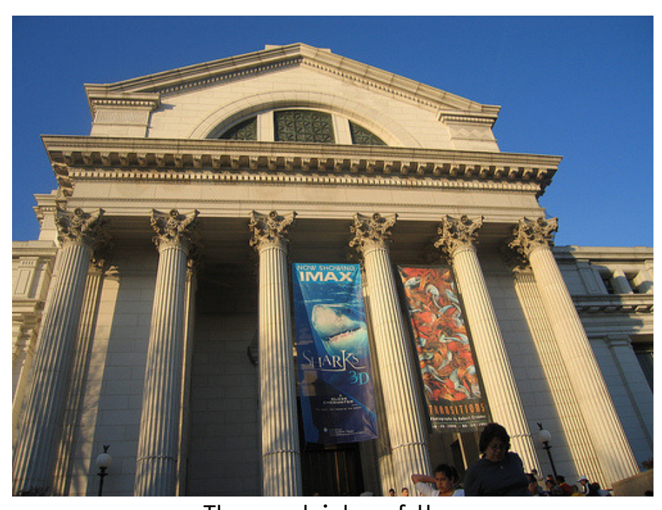
The outside of the National Museum of Natural History

Our family decided to go to the Smithsonian National Museum of Natural History in Washington, D.C. one cold Saturday morning in January.