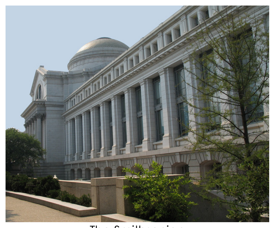
The Smithsonian National Museum of Natural History

Finally, we all went into the Photographic Gallery where there are beautiful pictures of nature.