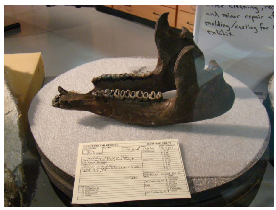
A fossil in the Fossil Lab

When we finished in the Gem Gallery, we went to the Insect Zoo. There, we saw a poisonous snake. It was red and black colored.