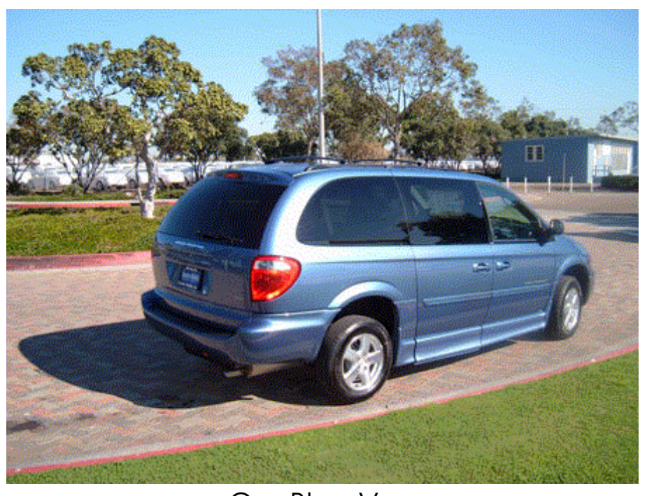
Our Blue Van

Then it was time to go. When we left the Museum we fed the birds outside with the bread from the lunch we had packed. As we fed the birds, we watched all of the people walking in the streets.